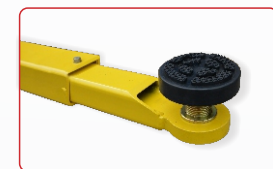
Features insert and screw rubber pads.