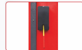
A manual locking safety release device controls the double locks.