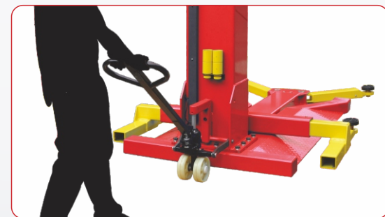
"Pallet jack"style device allows the lift to be moved wherever you need it.