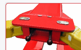
Arm locking device with easy release handles.