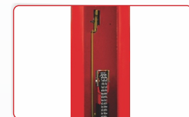
The chain protection cover prevents the chain from slipping off.