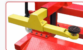
Adjustable arms with two stage positions.